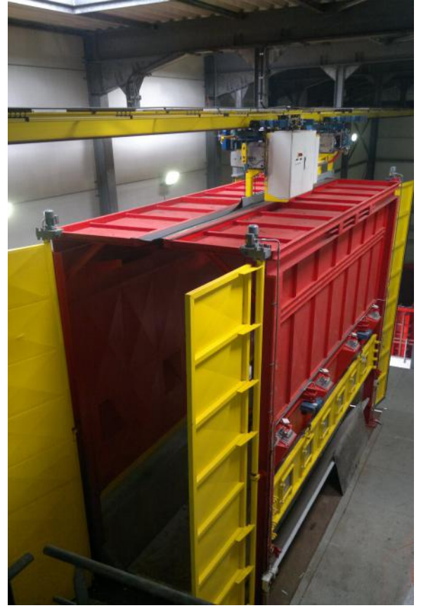
Zinc furnace with housing

Belgian company VERGO GALVA, based in the Flemish part of Belgium, is a manufacturer of the wide line of the steel parts of metal cable support systems – cable trays, ladders, trunks and other supporting elements. Hot-dip galvanizing plant is therefore the integral part of their manufacture technology, producing the final surface treatment as a protection against corrosion. Two years ago the company decided to modernize this technology fundamentally by the construction of a totally new plant in the area of the company.